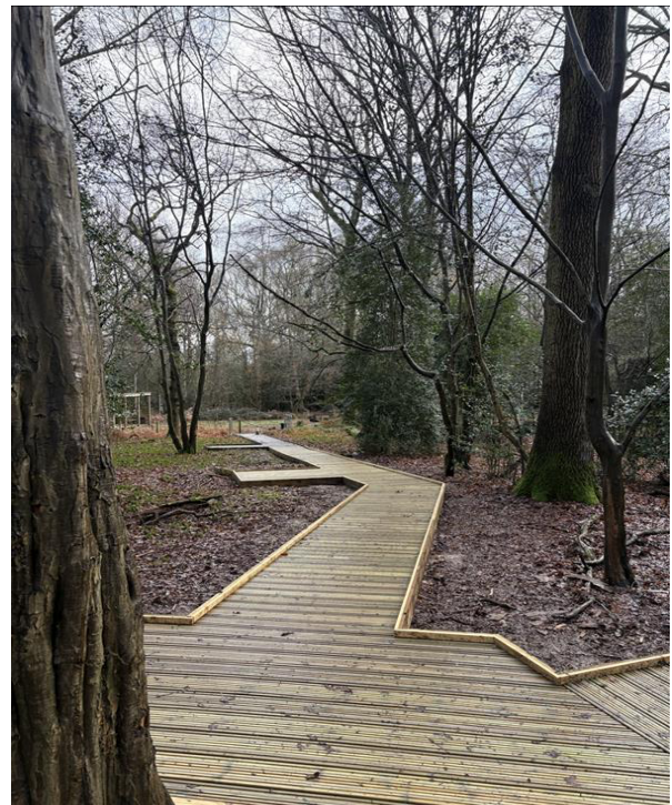
Images of the new wooden walkways in the Forest School and Woodland Area at St Piers

Updating the walkways means they are now safe and accessible to all students, even those with the most profound mobility needs and those who use wheelchairs. Forest School and Woodland learning is so important and beneficial to our students. It has such a positive impact on their health, wellbeing and physical and sensory development and allows them to experience activity through methods which are not bound by the restrictions of language.